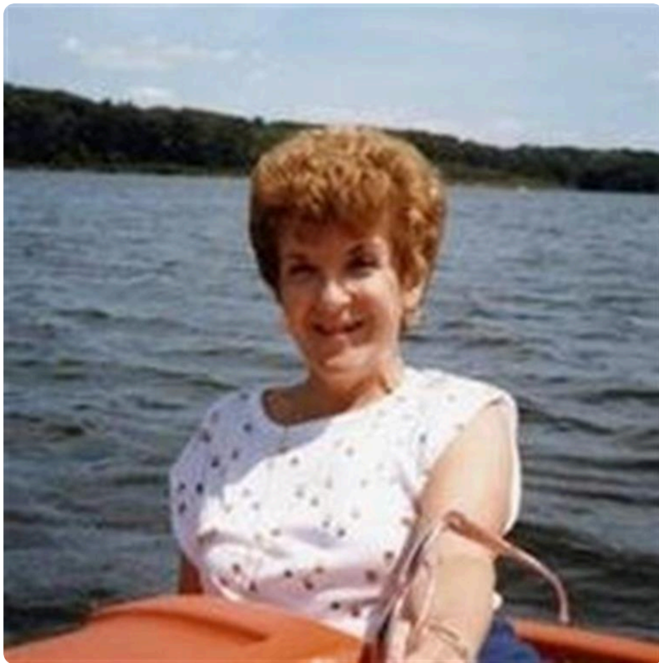
sailing on da boat, safety tip wear life preserver lol