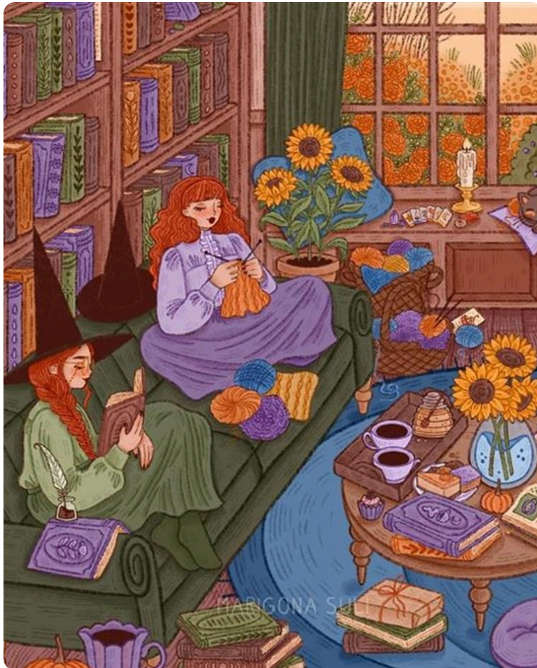
witches reading and knitting and shit