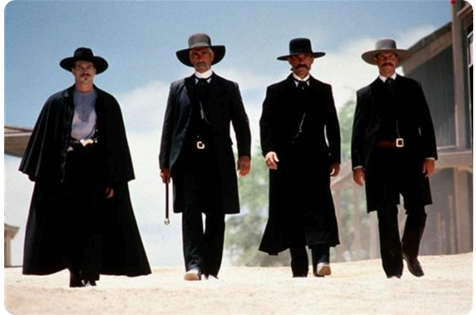
our condolences from all of us at tombstone