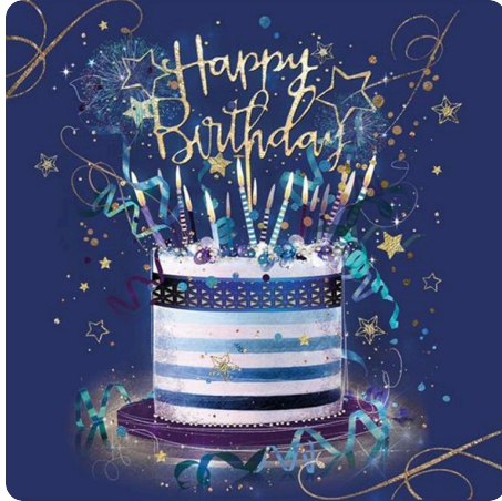
HAPPY BIRTHDAY!!!! from your cousins